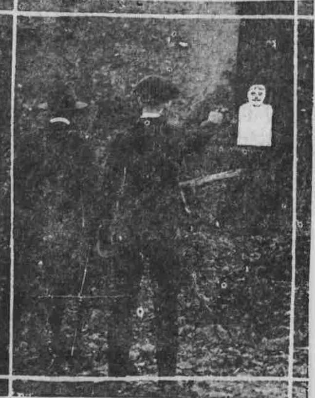
CHILLICOTHE, O.—Bandits are promised a hearty reception by the bowmen of this Ohio town. Bank officers and employees hold target practice every day after office hours. The picture shows how they learn to shoot to kill.