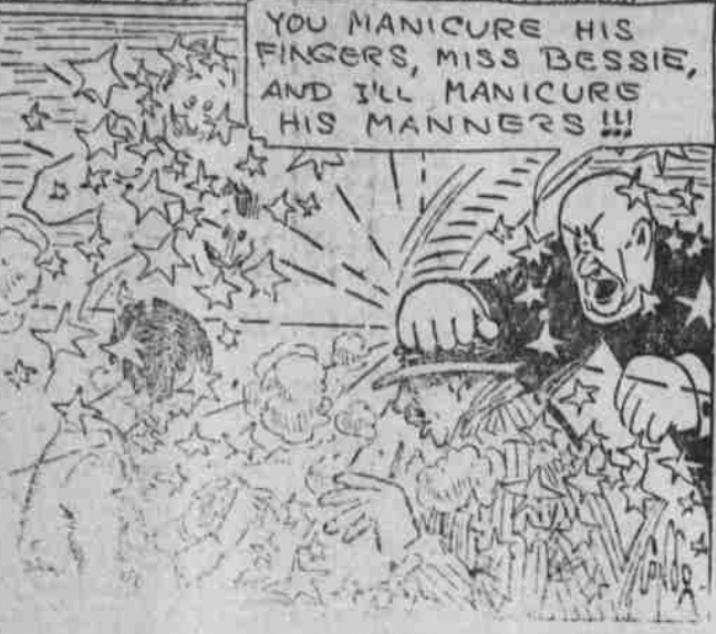
YOU MANICURE HIS FINGERS, MISS BESSIE, AND I'LL MANICURE HIS MANNERS!!!