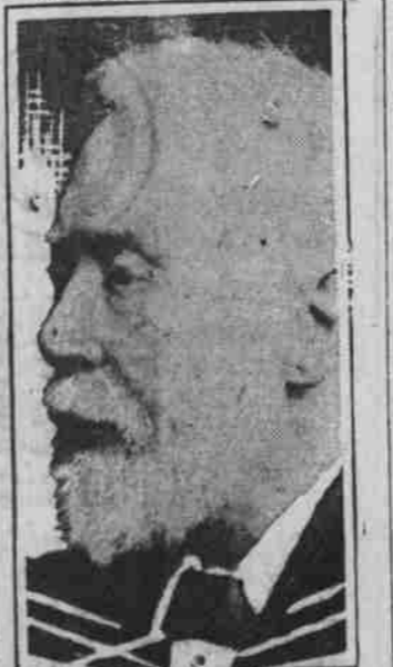
PROF. JOHN MACNEILL

DUBLIN—British forces have arrested Arthur Griffith, Sinn Fein founder, and acting president of the Irish "republic," and Prof. John MacNeill, founder of the Irish Volunteers.