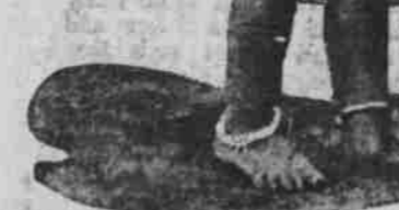
SINGAPORE—They start them off to work early in Singapore. Half-naked children, like the one shown above, are frequently seen carrying water from the well to their homes.