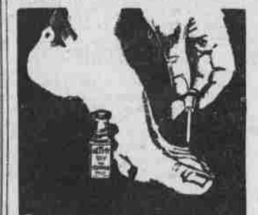
The Only Way to Cure a Corn is to Remove it with "Get-It"

Whether your "pet" is on top or between the toes, no matter how big or how small or how "tender" three drops of "Get-It" will lift you right out of your misery.