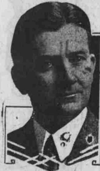
J. J. BLAINE

MADISON, Wis.—John J. Blaine, Republican governor-elect of Wisconsin, was the LaFollette-Nonpartisan League candidate nominated as a Republican. There are strong groups to the Legislature of progressives aligned with him and reactionaries bitterly antagonistic. Fur will fly when the Legislature meets in January.