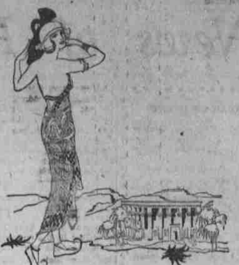
Palm and Olive oils were discovered in ancient Egypt 3,000 years ago