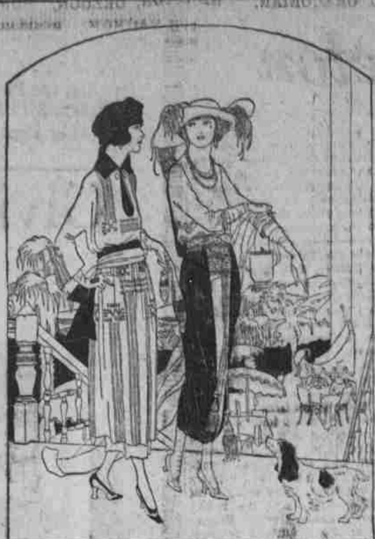
Money can't buy a greater luxury or surer way to beauty

ADMIRAL COUNDOURIOTIS ATHENS, Greece.—Admiral P. Coundouriotis has been named regent of Greece to rule during the minority of Prince Paul who is not quite 20 years old. Prince Paul, younger brother of King Alexander who was killed by a bomb's blast, has been proclaimed king of Greece.