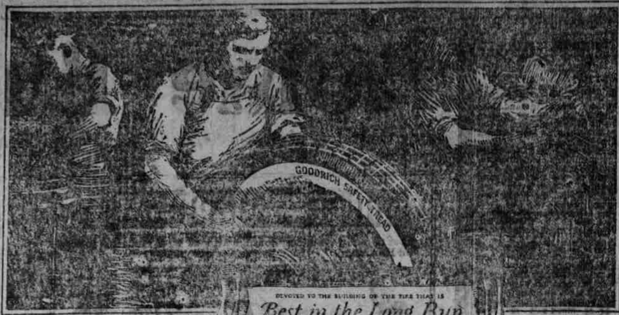
Best in the Long Run