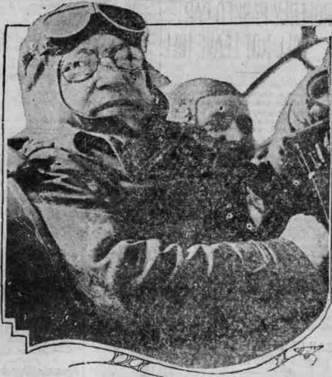
ROCKY MOUNTAIN, N. Y.—Samuel Gompers, president of the American Federation of Labor, recently took his first airplane trip. Gompers had an important address to deliver here, but missed his train at Buffalo. So the labor leader chartered an airplane and arrived here in time for the speech. The picture shows Gompers in the plane in full togs of the aviator.