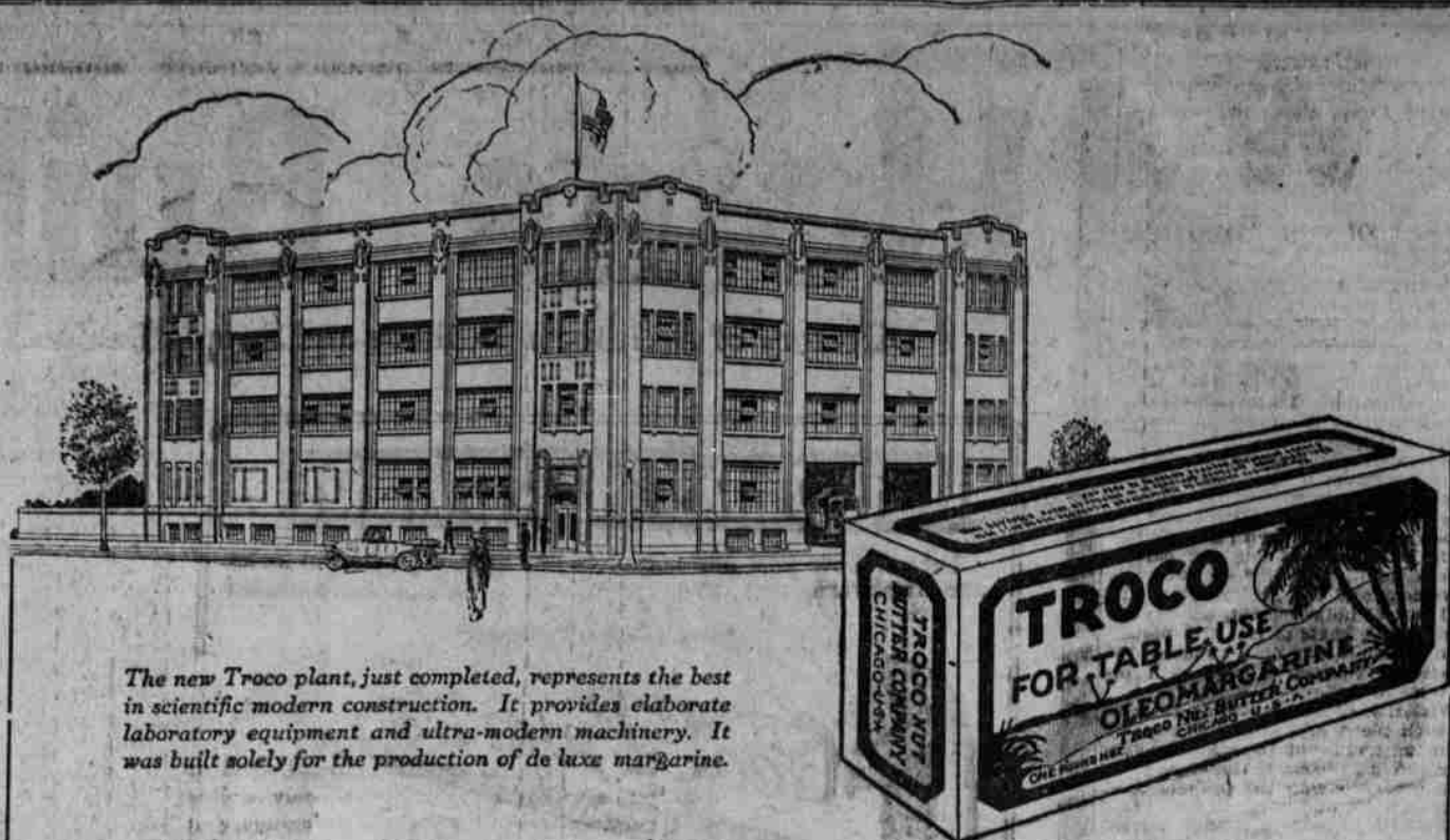
The new Troco plant, just completed, represents the best in scientific modern construction. It provides elaborate laboratory equipment and ultra-modern machinery. It was built solely for the production of de luxe margarine.