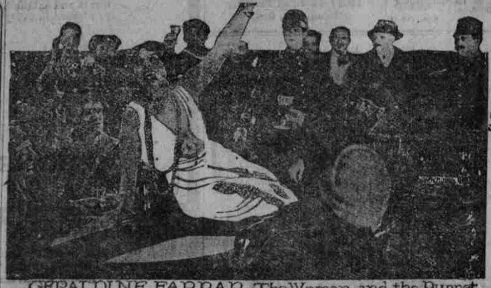
GERALDINE FARRAR in "The Woman and the Puppet" with LOU TELLEGEN.