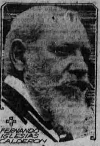
WASHINGTON—Fernando Iglesias Calderon, Mexican ambassador to the U. S., has established himself, and his staff, in the Mexican embassy, and is waiting for recognition.

(15) of said Township and Range: Thence South 27 degrees 35 minutes East 78 links; thence South 2 degrees 25 minutes West 75 links; thence South 29 degrees 25 minutes East 3.98 chains; thence South 52 degrees 50 minutes East 11.89 chains; thence South 21 degrees 20 minutes East 21.50 chains; thence South 18 degrees, 30 minutes 270 chains to the Township line between Township 35 and 36; thence South 4.54 chains to the quarter section corner between Sections 13 and 15 of Townships 35 and 36 E. W. M.