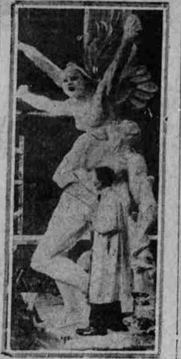
This photograph shows the new monument to be erected in Paris in memory of the momentous battle of Verdun. It is called "The Agony of Verdun" and as can be seen the sculptor has carried out the idea forcefully.