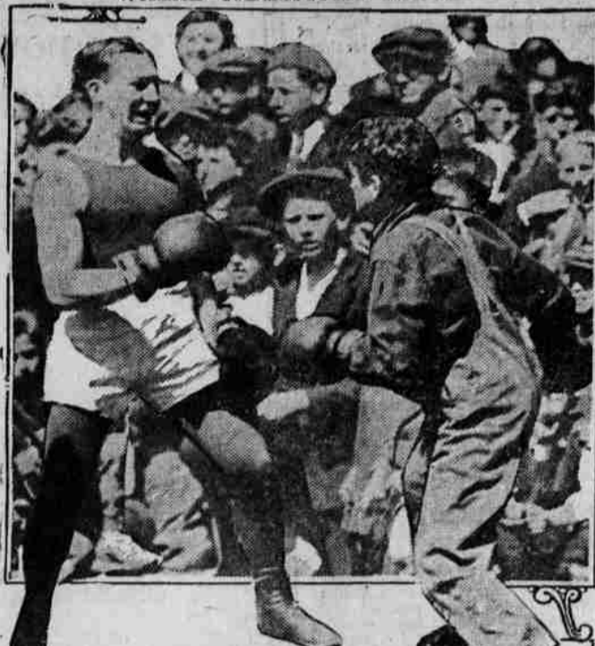
Who knows but what this rugged little Los Angeles newsboy will not be a champion fighter some day? He is boxing the light-weight king, Bennie Leonard, before his own fellows at a newsboy's show.