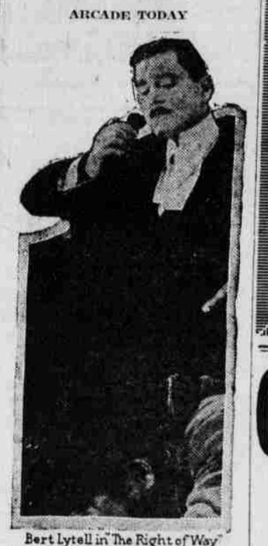
Bert Lytell in 'The Right of Way'

BY CARL D. Groat (United Press Staff Correspondent.) BERLIN, April 12.—Reports of a new revolutionary plot and a movement to declare a separation of the south German states, led by Bavaria, continue to be current here today. The Russian commissioner of order admitted he had been advised that the plotters had armed students, who were to be among the active forces in the proposed uprising.