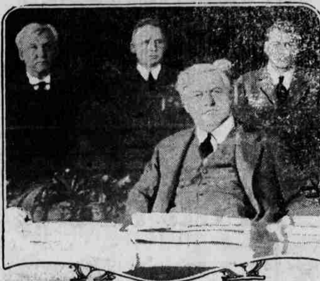
Atty. Gen. A. Mitchell Palmer ordered in to testify before the House Agricultural Committee, considering legislation to regulate the packers, defended his compromise with the packers by which they escaped anti-trust prosecution.