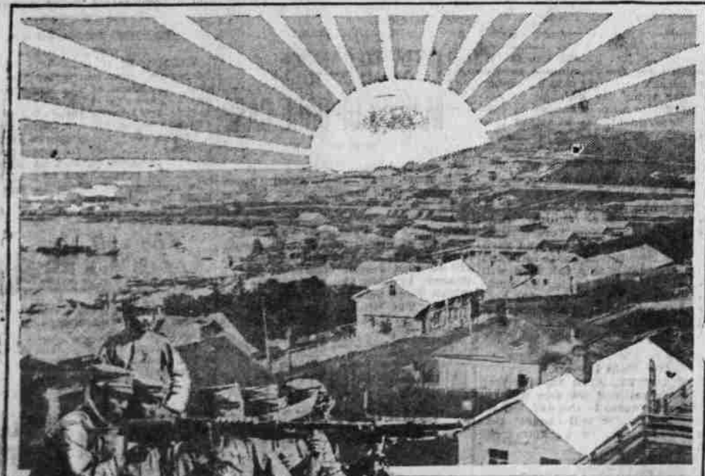
Japanese forces have occupied Vladivostok, shown here with a view of the harbor. Now the allies anticipate a man-size job convincing the Japs they ought to leave.