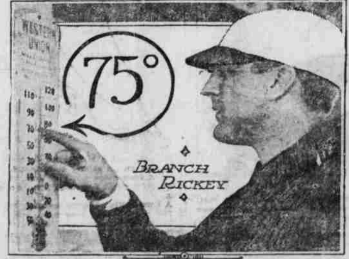
BROWNSVILLE, Tex.—Branch Rickey watches the thermometer and is satisfied that he has pitched his training camp in the right spot. This is Rickey's regular stunt on leaving the hotel for the ball park. The mercury rises at 75 in Brownsville.