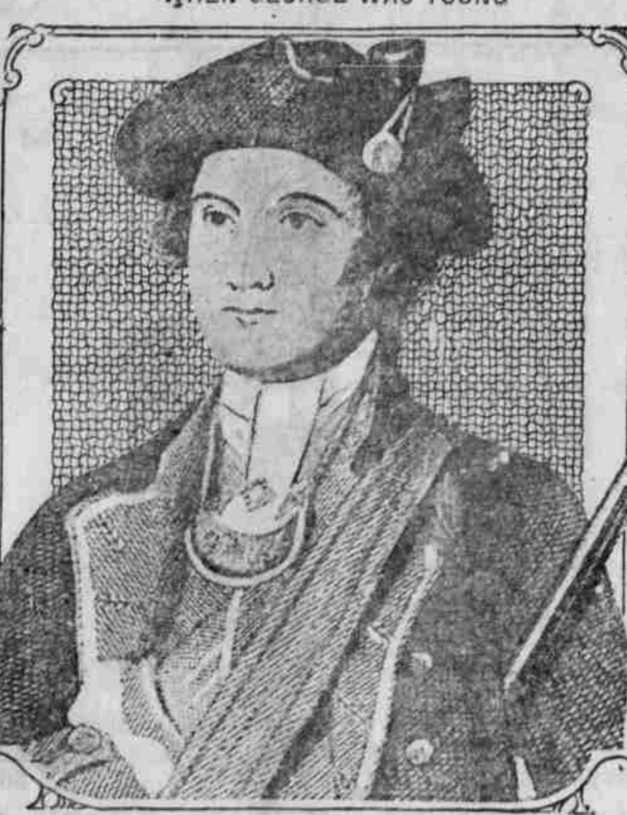
Washington in the uniform of a Virginia colonel, just about the time when he returned from his first western surveying trip.