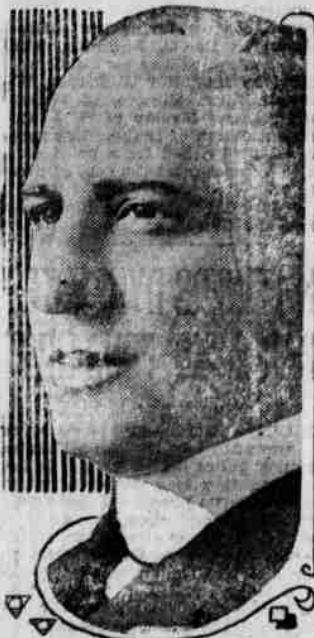
EDWARD P. MORROW