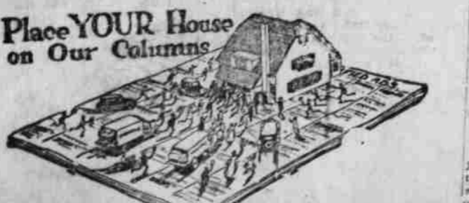
Place YOUR House on Our Columns

TWIN CITIES DISCUSS UNION HIGH SCHOOL MILTON, Jan. 31.—Despite the judges' decision to the contrary, sentiment for the proposed union high school seemed favorable at a meeting of the Dry Creek Literary society held two new titles in England's perance.