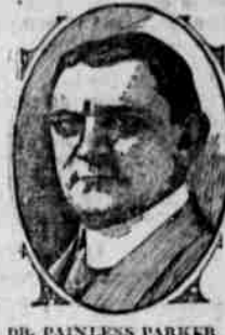
DR. PAINLESS PARKER