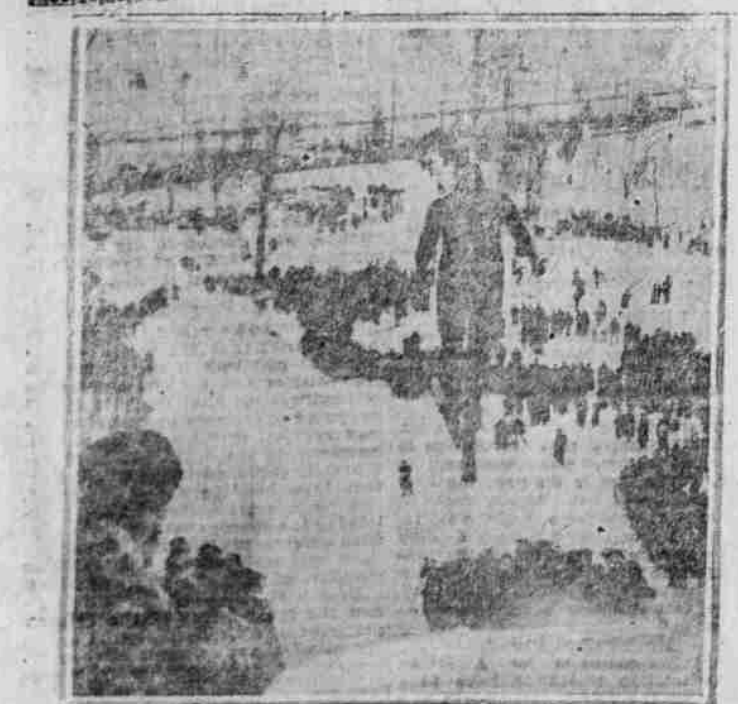
Although the snow shoe originated in Canada, the Norwegian ski is dividing popularity with it. Montreal, Quebec and Ottawa ski jumpers are enjoying the sport now on the nature of the snow on the slopes of Mount Royal, in Montreal. The jumper seen in the photograph soared seventy feet through the air before alighting on the slope far below. Much better jumps are made from artificial take-off in the less mountainous country. Great crowds gather to watch the daring sportmen.