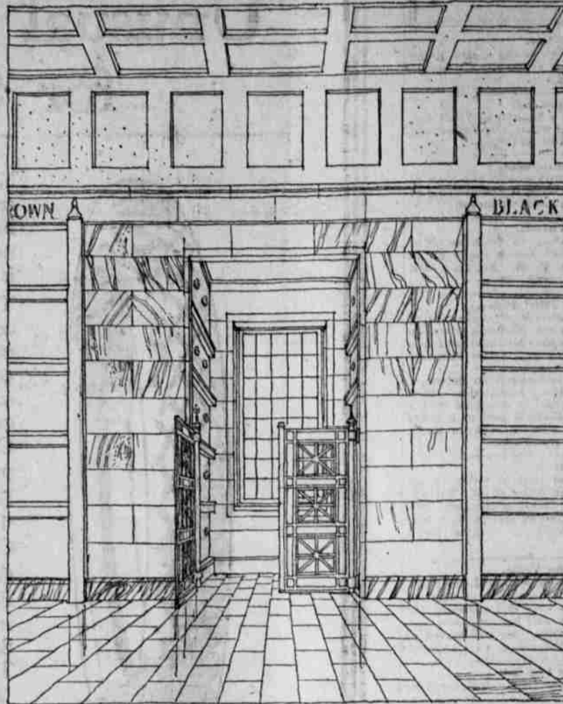
FAMILY ROOM IN SECOND UNIT OLNEY ABBEY MAUSOLEUM

The fury of the elements never can disturb the resting place of those who sleep within these marble tombs. Neither can they be desecrated by man. Tender, eternal care is their portion.