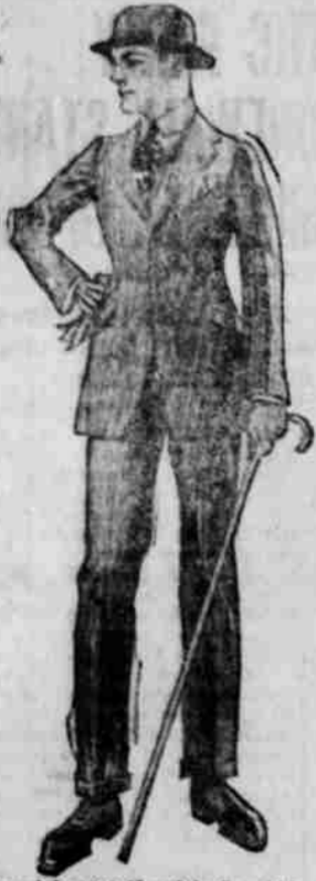
Copyright 1919, Hart Schaffner & Marx

STYLE IS ALL RIGHT STYLE-VALUE IS BETTER