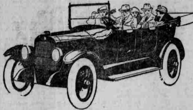
PRICES: Touring Car, 1925; Roadster, 1925; Fourseason Sedan, $1525; Fourseason Coupe, $1535. F. O. B. Factory. Wire Wheels and Spare Tires Extra.

It is generally known that this car does give able, faithful service at a low cost. The Dort is everywhere regarded as a car that possesses those comfort-giving, money-saving, time-conserving qualities that earn the truest satisfaction.