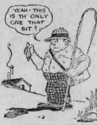
AND FISHERMEN FORGET THAT BIG ONE THAT GOT AWAY.