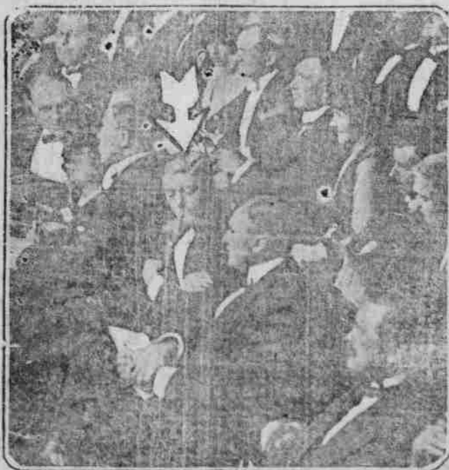
Right in the front row sat the Prince of Wales when Joe Beckett and Georges Carpentier did battle in the London ring. The prince pulled away on a big cigar until the announcer requested no smoking.