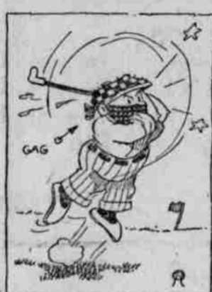
GOLFERS MIGHT SWEAR OFF SWEARING!