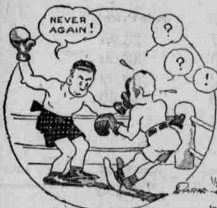
NO MORE CLINCHES FOR MITT SLINGER!