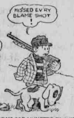
TIME FOR HUNTERS TO CUT LEAVING GAME BEHIND!