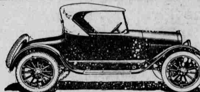
Chevrolet "Royal Mail" (Model FB) Roadster, $1110 f. o. b. Flint, Michigan