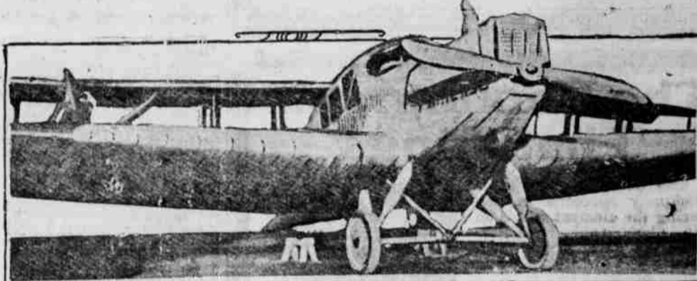
DVINSK—Forced to land by bad weather this latest German wonder is now in the hands of the Polish authorities. It is a monoplane of corrugated aluminum with hollow wings in which can be placed spare parts. It can carry eight persons—the biggest load any monoplane has carried.