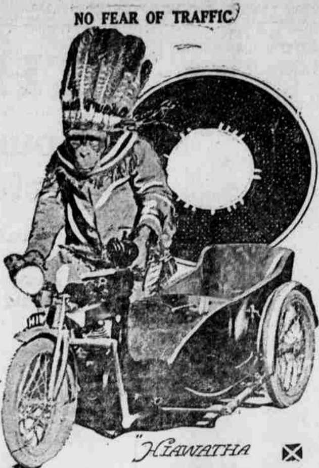
LONDON—"Hiawatha," a remarkable trained chimpanzee motors about London as fearlessly and expertly as a human being.