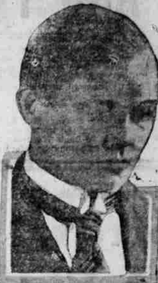
Thomas H. Ince presents CHARLES RAY