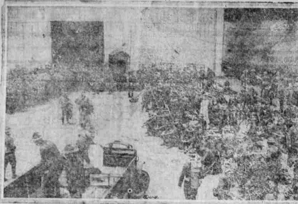
LONDON.—And on your right you see the tower of London, where the Kaiser will be confined.—Oh, yes, these German war prisoners are seeing the sights of Linnon town, such is the kindness of the British to their prisoners before they send them home.