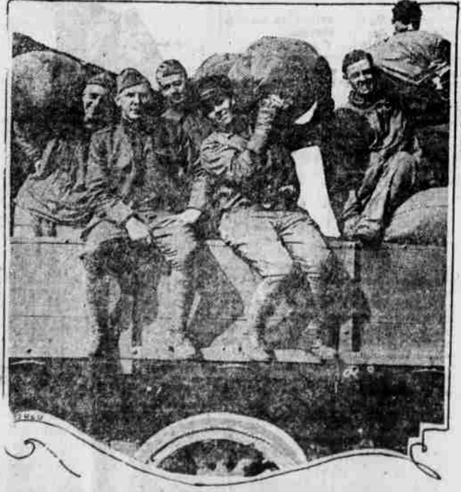
HOBOKEN.—Five thousand army regulars are on their over." They're too late for the fighting but they'll get in on Watch on the Rhine," and this detail seems happy over it.

White Truck performance is so widely and favorably known, it is considered standard among truck users. It is the basis for judging truck operation and main-Everywhere White Trucks are known