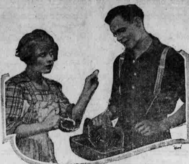
"My last quarter" A Paramount Picture AT THE ALT ATODAY.