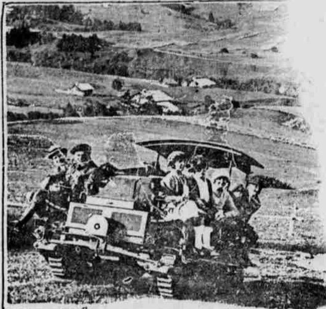
MEXERIE, France—The war tank is now a peaceful vehicle. Ten passengers can see the beautiful scenery of the French-Alpine country in his bus. It climbs the mountains with little exertion. It was General Estienne's idea. General Estienne has charge of Alpine sports.