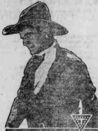
WILLIAM DESMOND IN TRIANGLE PLAY "DUCE DUNCAN"