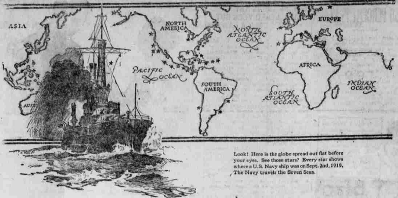
Look! Here is the globe spread out flat before your eyes. See those stars? Every star shows where a U.S. Navy ship was on Sept. 2nd, 1919. The Navy travels the Seven Seas.

Jad Salts is inexpensive and cannot injure; makes a delightful effervescent lithia-water drink which everyone should take now and then to keep the kidneys clean and active and the blood pure, thereby avoiding serious kidney complications.