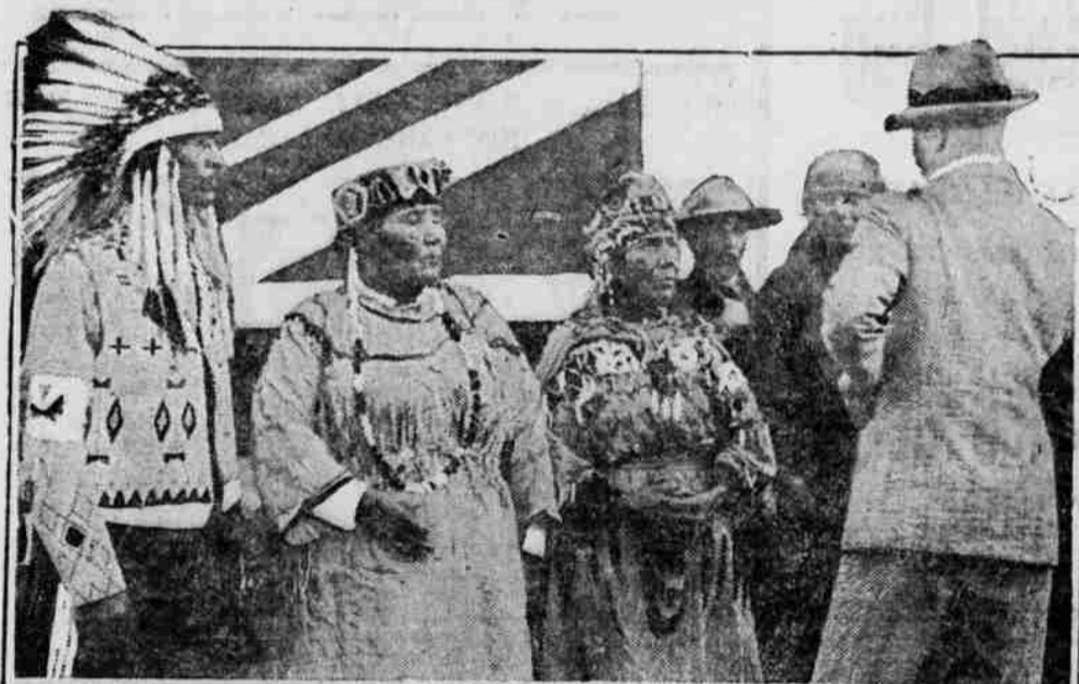
VANCOUVER, B. C.—Shushwap Indians who met the Prince of Wales here donned all their finery of their hereditary rank for the presentation. And they met a young man in dress and manner just like the other young white men they knew. Perhaps they think someone is spoofing them, as they give him the oche over.