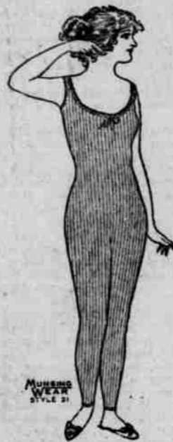
MUNSING WEAR STYLE 21

It's easy to Union Suit you in Munsingwear no matter the size of your person or purse. There's service and all 'round satisfaction in each garment and the satisfaction lasts.