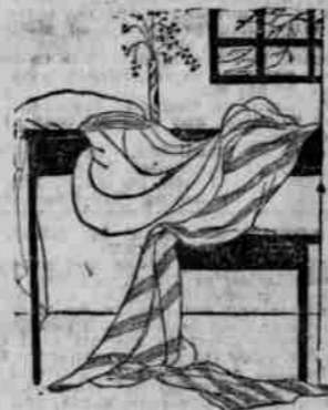
Novelty Dress Goods... $2.50 to $5.00 Coating... $2.50 to $7.50 Etc.—Etc.

It's high time to be getting that new Fall dress or suit. Buy the goods and make them up. You'll find the newest weaves and colorings here and they're ready for your inspection. Be sure to have a look here before deciding what you want. Epingle... $2.00 to $4.00 Poiret Twill..... $5.00 Gabardine $4.00 to $5.00 Tricotine $5.00 to $8.50 Flannels... $1.75 to $4.00 Serges... $2.00 to $4.00