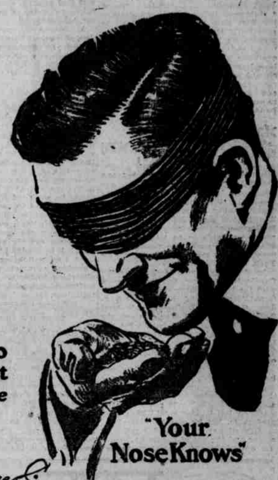
NOTE "papers"—the lightest; thinnest, strongest, and best in all the world, make a wonderful Tuxedo cigarette. Try one!

Finest Burley Tobacco Mellow-aged till perfect Plus a dash of Chocolate