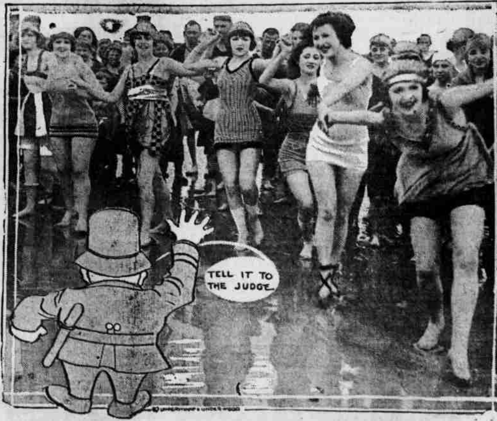
When these beauties appeared on Neptune Beach at Coney Island, of course everybody gasped, then gathered about them. The beach patrol came up to learn the trouble—and you can guess the rest. They're those daring Mack Sennett bathing girls again.