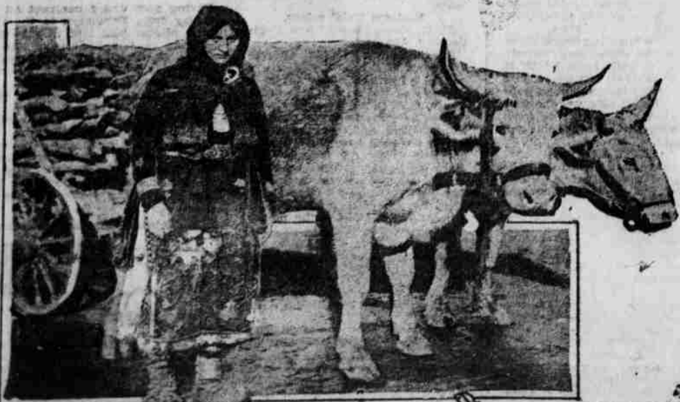
When the Red Cross Special Survey Mission went through Serbia, it found most of the transportation carried on like this. Ox teams driven by Serbian women haul food, and the lack of faster vehicles left many to suffer want.