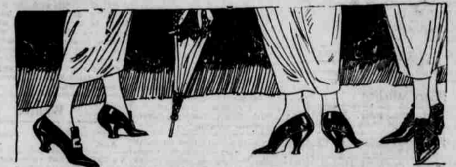
Use Dr. Scholl's "3" Necessities for your sore feet.

For your children's footwear do not overlook our large assortment of slippers in both Mary Jane or Instep Strap Patterns made up in White Canvas, White Kid, Black Kid, Brown Kid or Patent Leather, and the price, it certainly will please. "WE FIT THE FEET."