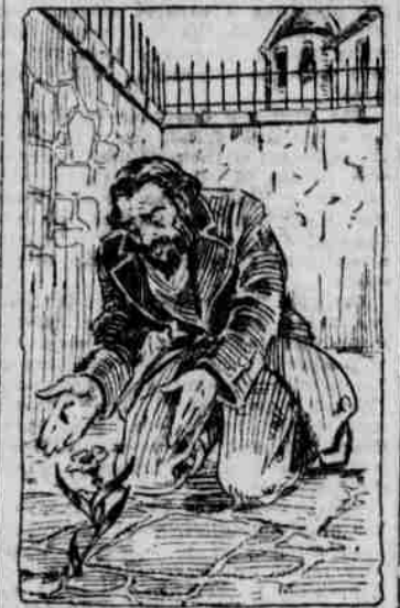
"Please Don't Leave Me."

HYDRA-HEADED WORDS 1. I am a tree, change my head I am a month, change once more I am to dry. 2. I am a bird, change my head I am speedily, change once more am a favor. 3. I am an animal, change my head I am to pick, change once more I am a bird. 4. I am to jeer, change my head I am to sway, change once more and find a faucet. 5. I am a woolen material, change my head I am to be near, once more I am to absorb. 6. I am a number, change my head I am to blend, once more I am to place. HIDDEN FLOWER My first is in hemlock but not in oak. My second's in sodden but not in soak. Third is in violet but not in red. Fourth is in Michael but not in Ted. Fifth is in mutton but not in beef. Sixth is in petal but not in leaf. Seventh is in April but not in May. Eighth is in morning but not in day. Nine is in pound but not in sound. Tenth is in circle but not in round. The secret of my whole so fragrant and fair. Perfumes the soft sweet summer air. ANSWERS HYDRA-HEADED WORDS—1. Larch March. 2. Lark-Lark-Lark. 3. Bull-Cull-Gull. 4. Mock-Rock-Cock. 5. Serge-Verge-Merge. 6. Six-Mix-Flig. HIDDEN FLOWER—Heliotrop. ARITHMETIC PUZZLE RAT add UICK add C less TACK add HAT add CARD less GAP less T equals RICHARD.