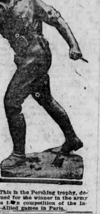
This is the Pershing trophy, designed for the winner in the army rifle team competition of the Inter-Allied games in Paris.