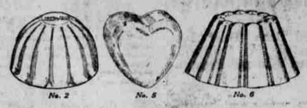
Individual Molds A Set of Six for Jiffy-Jell Real-Fruit Desserts

Jiffy-Jell is for salads as well as for desserts. And we offer this 50-cent aluminum mold for use in making salads.