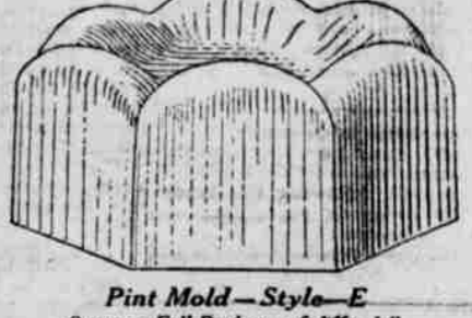
Pint Mold—Style—E Serves a Full Package of Jiffy-Jell

Jiffy-Jell, Waukesha, Wis. I enclose..... end labels naming the flavor, for which send the molds I check. .....Salad Mold, Style—D. .....Pint Mold, Style—H. .....Pint Mold, Style—E. .....Six Individual Molds.