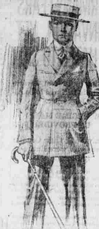
Copyright 1919 Hart Schaffner & Marx

They have furnished us with suits in regular sizes; suits for stout men, tall men, short men; clothes for men who like the more extreme models like the waist-seam style shown here; two and three button sacks for those who prefer something more conservative. All we ask is a chance to prove how well we can take care of you.