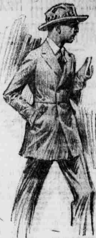
Copyright 1919 Hart Schaffner & Marx