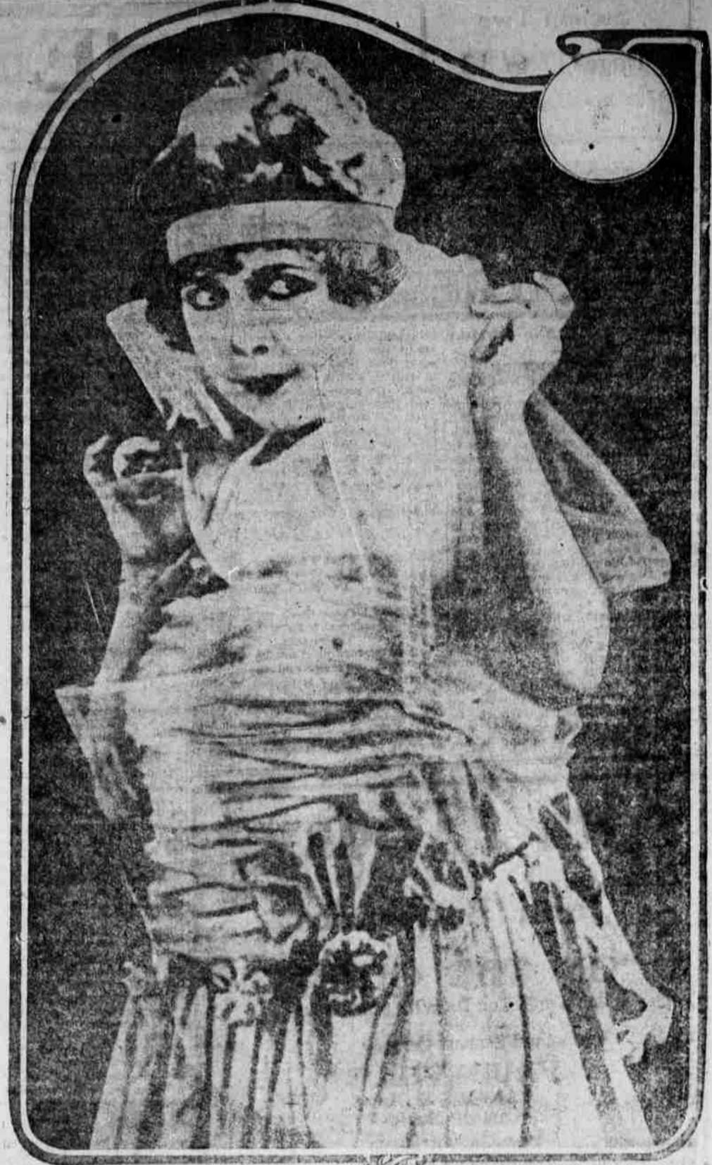
DOROTHY PHILLIPS, WHO PLAYS THE LEAD IN THE BIG PICTURE "HEARTS OF HUMANITY," AT THE ARCADE TODAY.