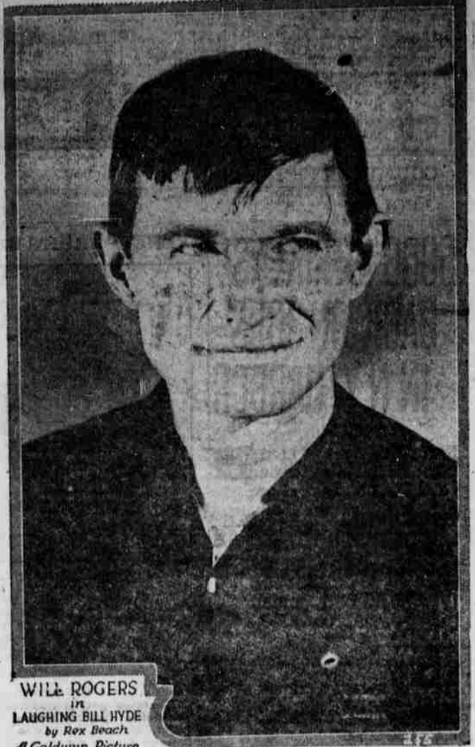
WILL ROGERS in LAUGHING BILL HYDE by Rex Beach A Goldwyn Picture

Linens, Long Cloths, Crashes, Damasks, Challies, Scrims, Towels and Rugs. A great new lot of bargains placed on sale in the Bargain Basement Monday morning.