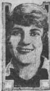
Pearl White (Pathé)