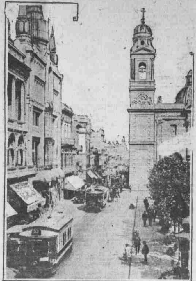
This is Calle Sarandi, one of the principal streets in Buenos Aires, where Bolshevik agents provoked riots which resulted in scores of deaths and hundreds of injuries, besides heavy property loss. Buenos Aires is one of the most modern and beautiful cities in the world, but its wealth makes it a target for revolutionaries.