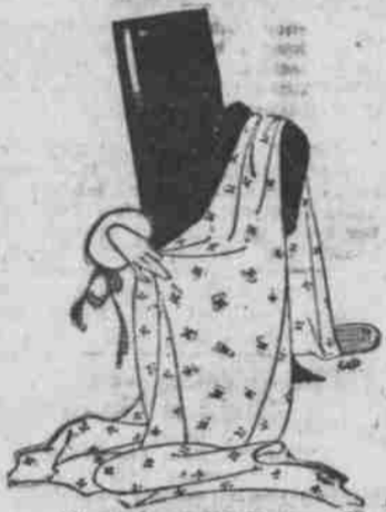
Two Special Lots of FANCY SILKS at $1.69 and $1.89

A remarkable opportunity to purchase silks that are the very latest in style and weave at a considerable saving. Under ordinary conditions you could not hope to get such fine silks underpriced but our policy of no "carry overs" is what does it.