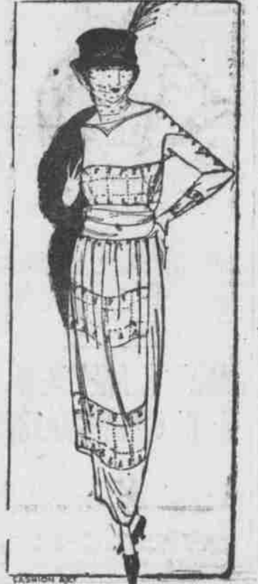
This cloth and chiffon frock may do double duty, and is suited to both afternoon and evening wear. The foundation gown is fauqe-chiffon velvet, with bands of tacked chiffon and velvet buttons as the only trimming.